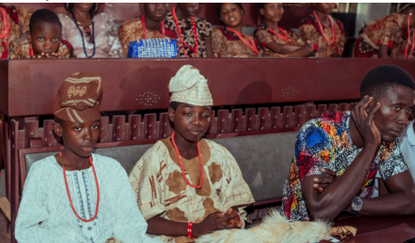
Government College Participants