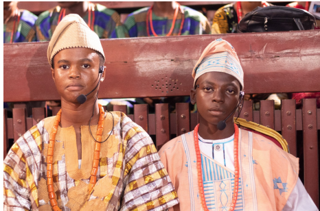
Finalists, St. Patrick's Grammar School