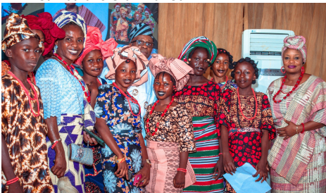
Participants from Lofty College who emerged in 3rd position at the event