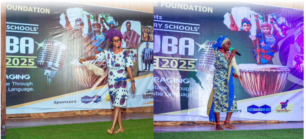
Ídí tí èdè Yorùbá fi jẹ̀ kókó | Èdè Yorùbá jẹ̀ ọ̀kan lára èdè ilẹ̀ adúláwọ̀ tó lórọ̀ nínú ọ̀wẹ àti imọ̀ iran. Ó n ẹ̀ ànínṣe idánimọ̀, ó n rọ̀ àjọṣe àwújọ̀ lágbára, bẹ̀ẹ̀ ló sì n ẹ̀ ẹ̀ itọ́jú imọ̀ iran.

“Yorùbá kì í ẹ̀ ẹ̀ èdè nìkan – ọ̀ jẹ̀ ọ̀gún.”