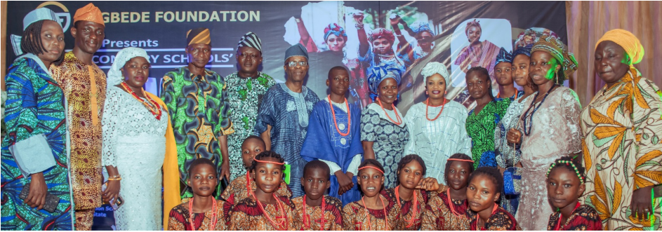
Mogbede CEO and the Panel of Judges with participating schools