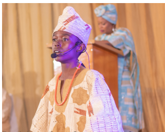
Participant from Government College Ibadan