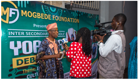
Interview with BCOS