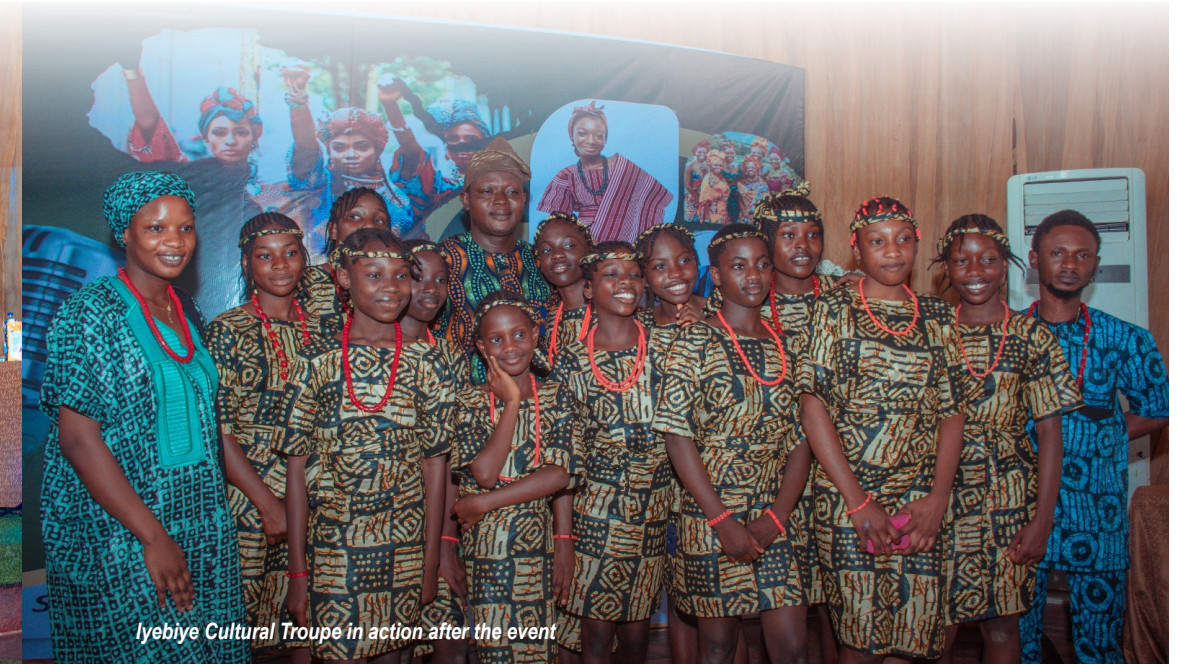
Iyabiye Cultural Troupe in action after the event

Àwọn ilé-ẹ̀kọ́ tó yege ni: Government College Apata St. Patrick's Grammar School Lofty College