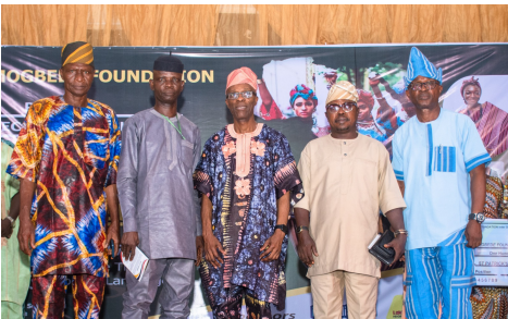
The CEO of MOGBEDE Foundation with dignitaries at the event