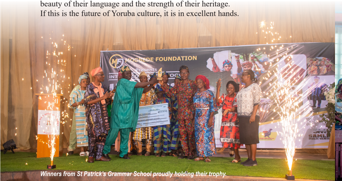
Winners from St Patrick's Grammar School proudly holding their trophy.

The Mogbedé Foundation's Yoruba Schools' Debate was more than a competition - it was a cultural renaissance. Over four days, young people rediscovered the beauty of their language and the strength of their heritage. If this is the future of Yoruba culture, it is in excellent hands.