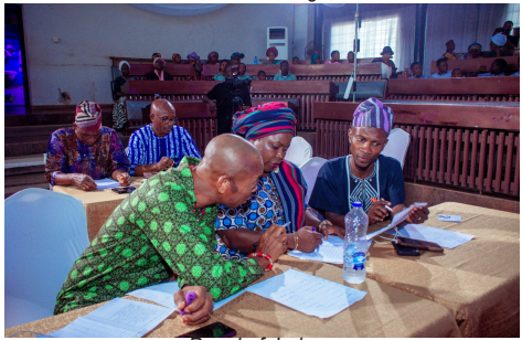
Panel of Judges