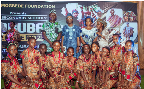
Signs and Wonders cultural troupe with Mogbede CEO and other dignitaries at the event.