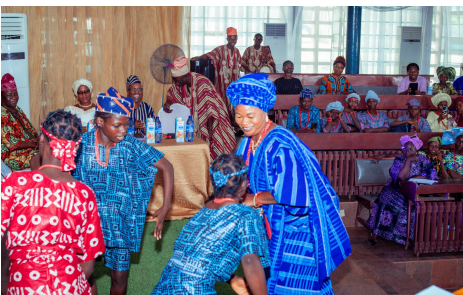
Senior Special Adviser to Oyo State Government on Culture dancing with students