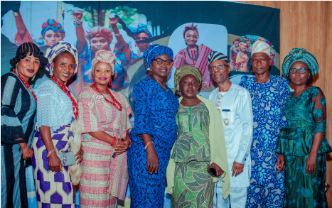
Mogbede CEO with teachers present at the event