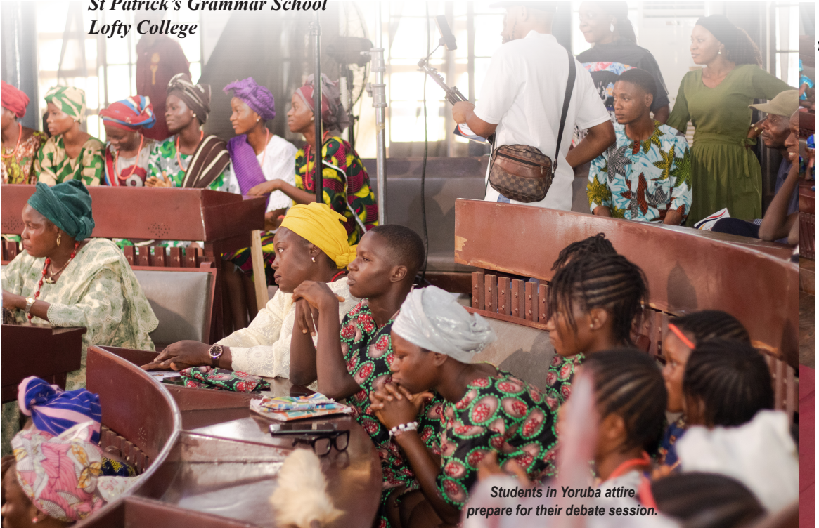
Students in Yoruba attire prepare for their debate session.

Qualified Schools Bishop Philips Academy Government College Apata St Patrick’s Grammar School Lofty College