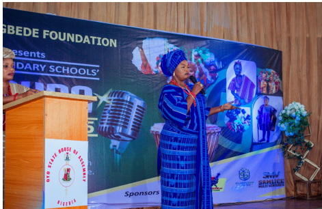
Hon. Omolara Adebayo, SA to Oyo State Gov on Arts & Culture