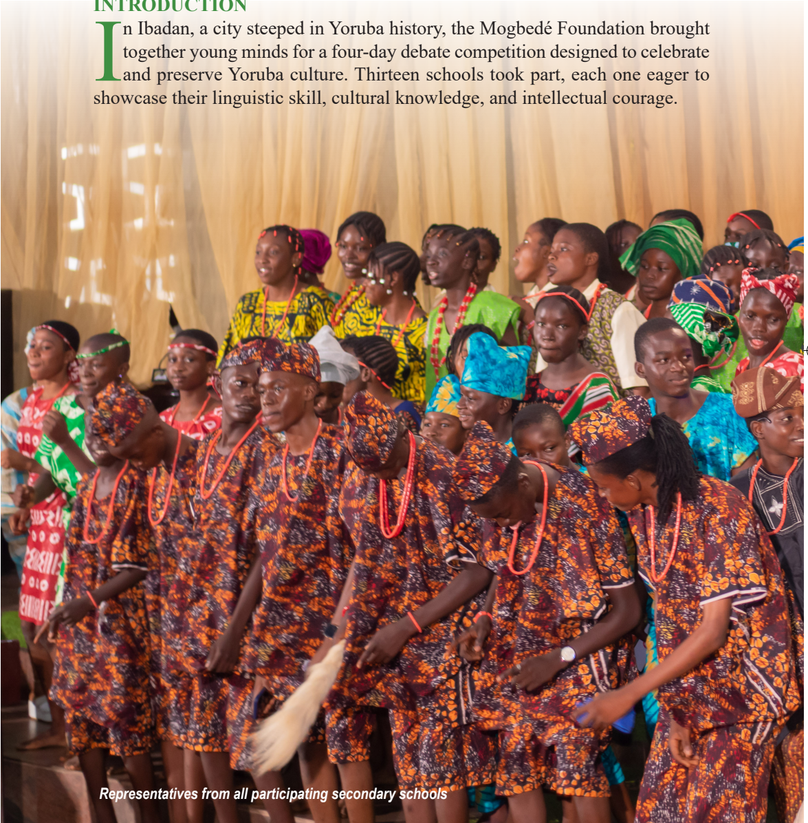
Representatives from all participating secondary schools

In Ibadan, a city steeped in Yoruba history, the Mogbedé Foundation brought together young minds for a four-day debate competition designed to celebrate and preserve Yoruba culture. Thirteen schools took part, each one eager to showcase their linguistic skill, cultural knowledge, and intellectual courage.