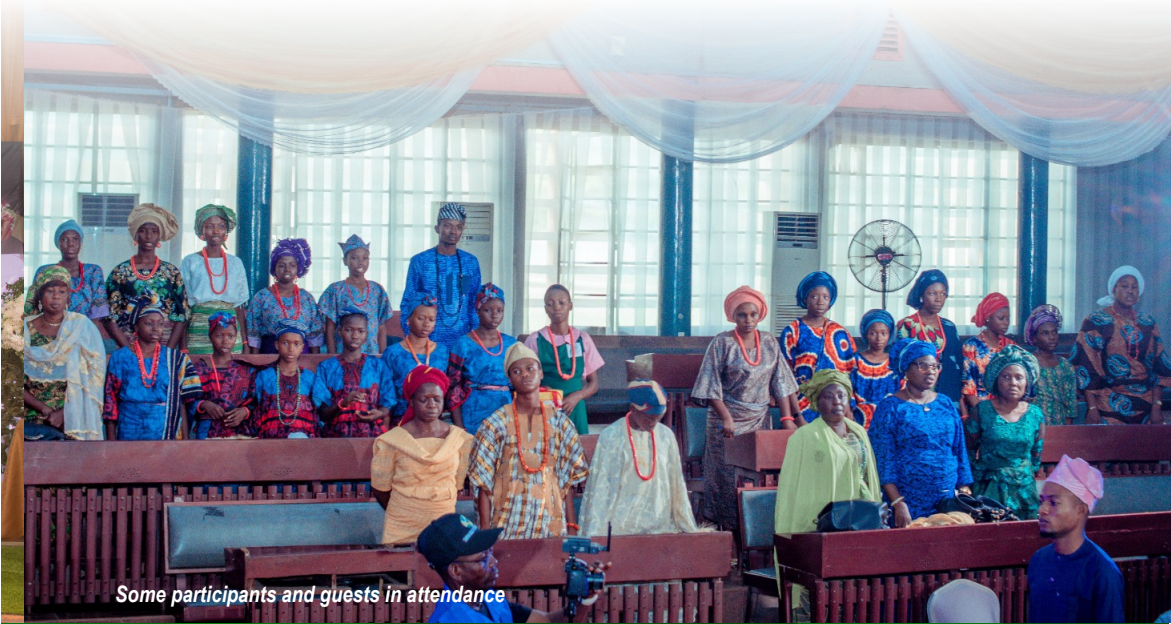
Some participants and guests in attendance

Ídíje àrìyànjiyàn Yorúbá fún ilé-ẹ̀kọ̀ láti ọwọ̀ àjọ Mogbedé Foundation jẹ èrè ìdíje tó jẹ ìgbé díde àşà ni. Bii ojó mérin bàyíi, àwọn ọ̀dọ̀ tí şe àwárí ẹwà èdè àti agbara ogún wọn lẹ́ẹkan sí i. Bí èyí bá jẹ ojó ọ̀la àşà Yorúbá, a şé pé ó wà lówọ̀ tó dára.