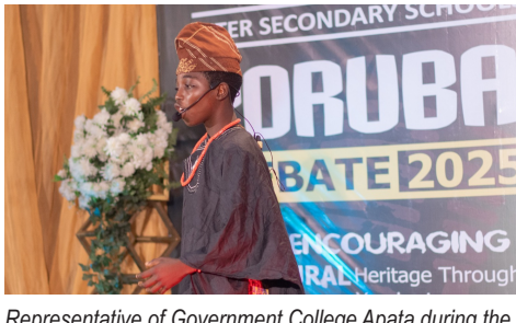
Representative of Government College Apata during the debate session.