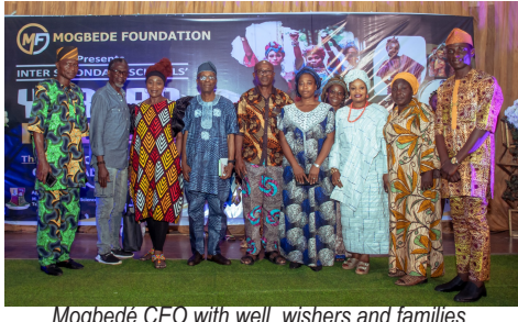
Mogbede CEO with well wishers and families at the event.