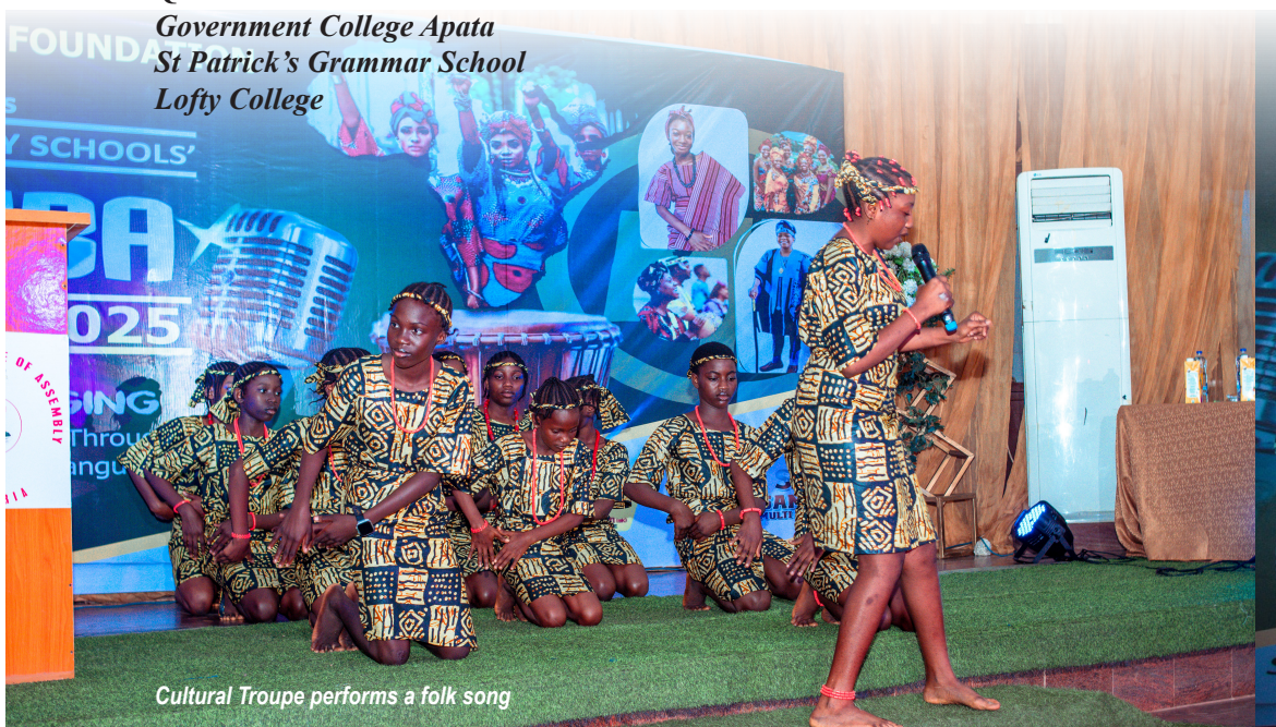
Cultural Troupe performs a folk song