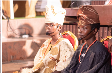
Finalists, Gov. College, Ibadan