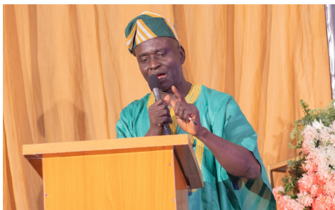
Representative of the Commissioner for Education Oyo State delivering the commissioner's speech