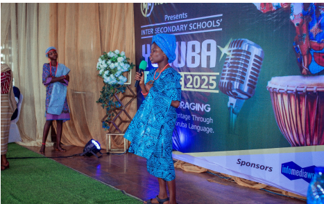
Oba Akinyele Memorial Grammer school representative